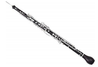
04: English horn