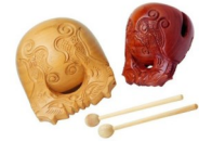
35: Wooden fish