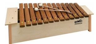
43: Xylophone [zai'ləfəʊn]