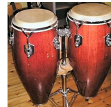
30: Conga [kʌŋɡə]