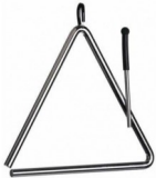
32: Triangle [traɪ'æŋɡl]