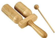
40: Agogo [a:góʊɡʊ]