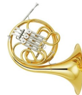
12: French horn