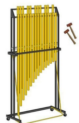
47: Tubular bells [t(j)ú:bjʊlə-]