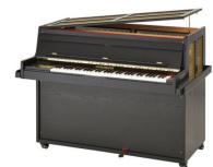
20: Celesta [sələste]