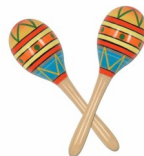
41: maracas [mə'rækəs]