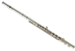
01: Flute [flú:t]

LL Shihoya Arai School, M-PEC www.shihoya.com