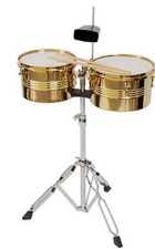
31: Timbales [tɪm'ba:li:z]