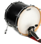
26: Bass drum [bérs dr'ʌm]