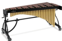
44: Marimba [mə'rɪmbə]