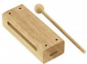
36: Wood block