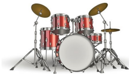
28: Drum set