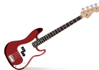
18: Electric Bass [i'lektɪkbeis]