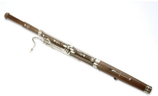
05: Fagotto [fə'gɒtəʊ]