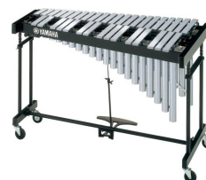
46: Vibraphone [vaɪbrə'fəʊn]