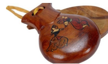
34: castanets [kæstənétʃ]