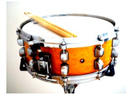
25: Snare drum [snéə dr'ʌm]