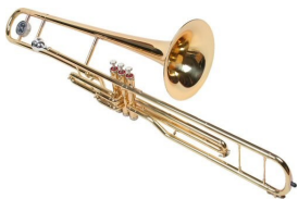
13: Trombone [tram'boʊn]