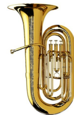
16: Tuba [t(j)ú:bə]