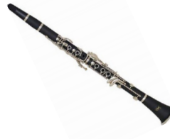
07: Clarinet [kl'ærənét]