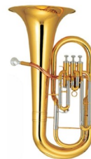
15: Euphonium [ju:'fəʊniəm]