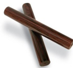
37: Claves [klaɪvɛs]