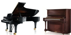
21: Piano [pi'ænəʊ]